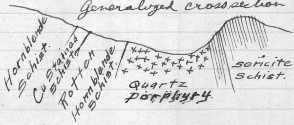
Generalized cross section

Sericite schist dips about 80° to the E, and on the other