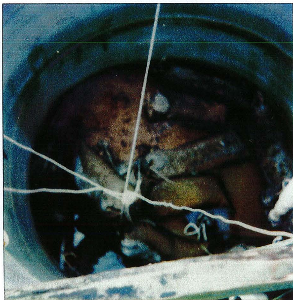
Thomas - Bags of Carbon are stripped Sol in Tank for cleanup. T+M #1 + T+M #2 8/25/87