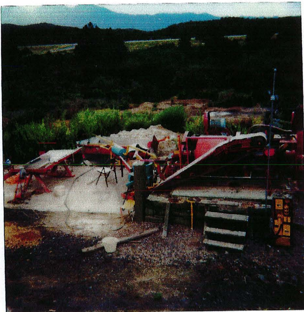
Gravel Pit Mill of Thomas (Not Now in Use) T+M #1 + T+M #2 8/25/87