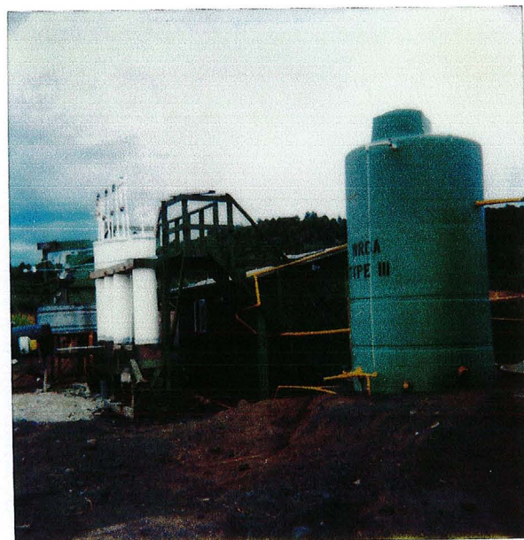
Gila County Thomas - Carbon Columns left over from Cyadule Era T+M #1 + T+M #2 8/25/87