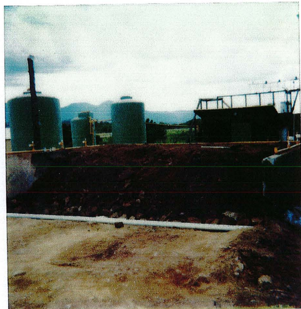
50 Ton Pad at Thomas T+M #1 + T+M #2 Gila Co 8/25/87