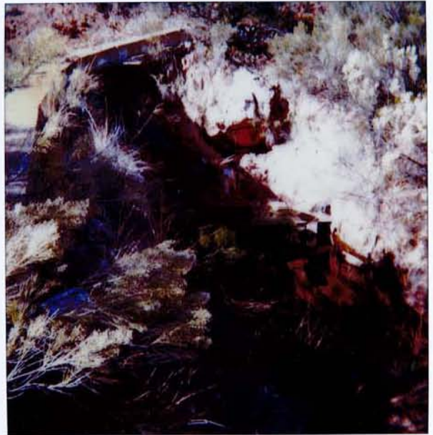
White Cow 1/17/85 Water filled Decline Portal