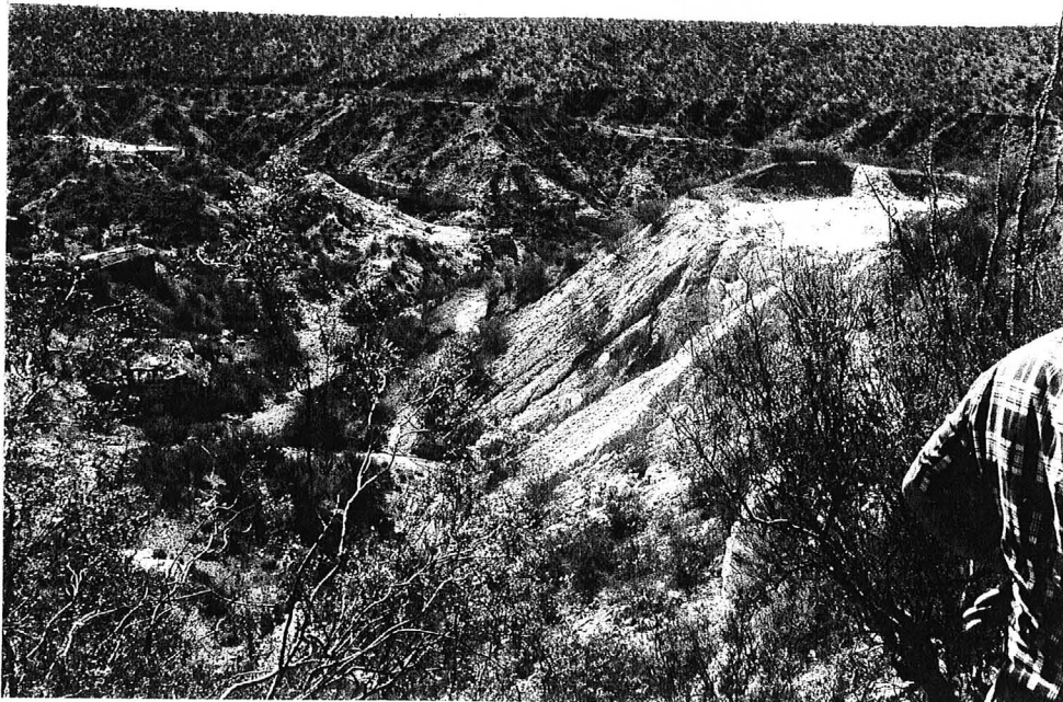
4/5/1992 SPENCER CHEMICAL DIATOMITE- SOUTHERN PIT AZ MILS PINAL 762