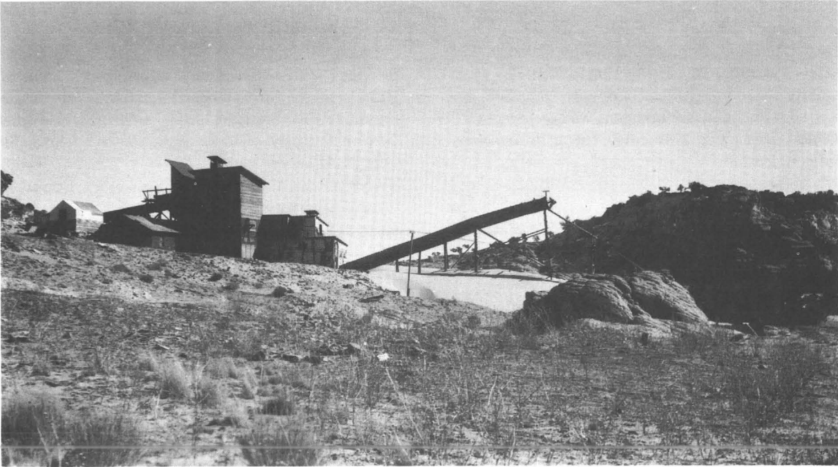
Unidentified photo # A-200-23. Unknown surface plant. The long inclined devise in the center appears to discharge tailings.

GSA RESOURCES INC. 7660 N. Business Park Drive, Tucson, AZ 85743 - Phone (520) 744-8845 - Employees: 8 (including contractors).