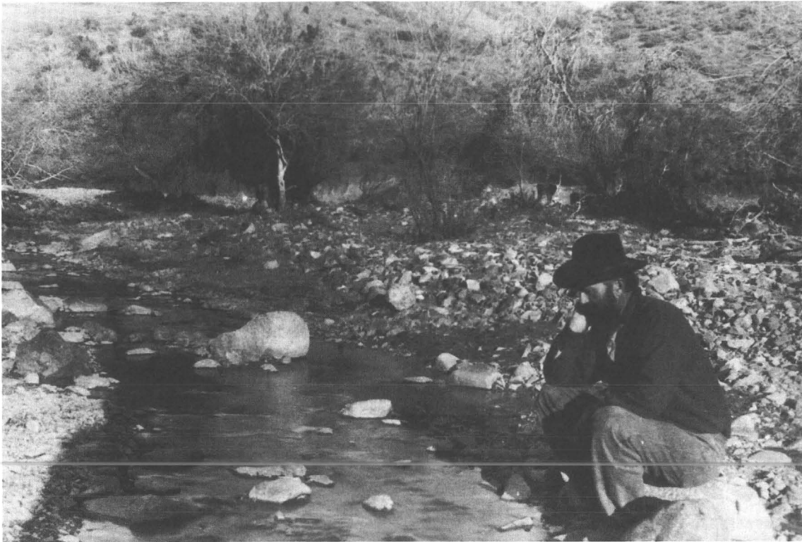
Unidentified photo #A-200-27. Unknown miner, unknown date, unknown stream, unknown dilemma.

Phelps Dodge and Cominco continue a joint venture exploration agreement on the United Verde massive sulfide deposit at Jerome. The property, one of the largest zinc resources in the U.S., contains 21 million tons grading 6.6 percent zinc, plus copper and precious metals.