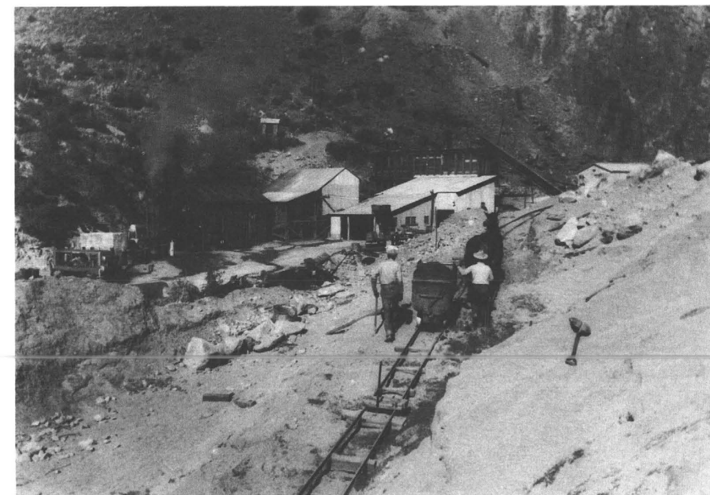
Unidentified photo #A-300-01 Unknown Arizona mine, circa 1940.