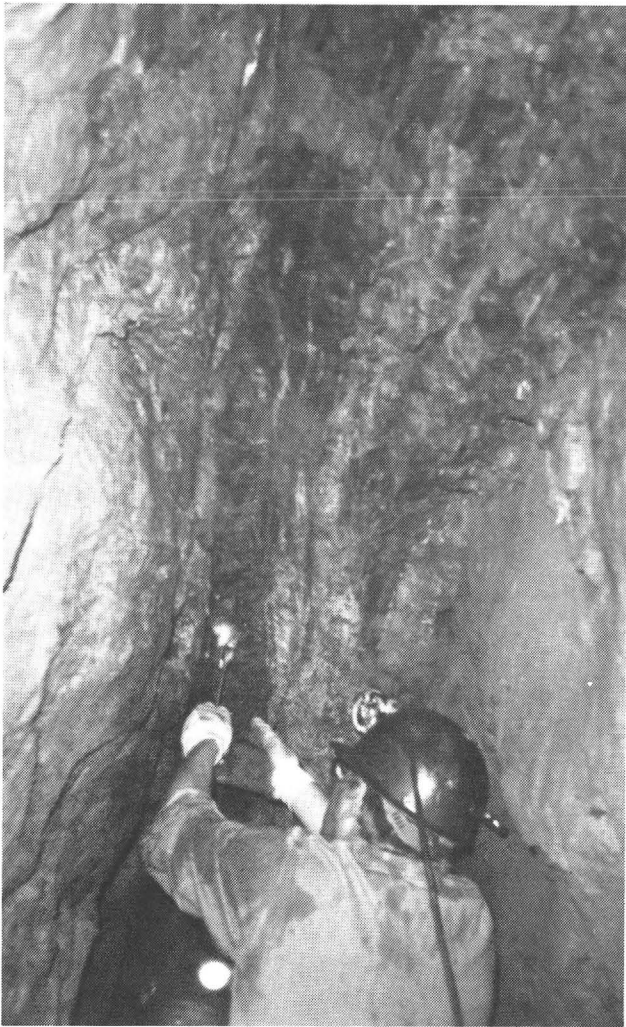
Sampling a pyrite/chalcopyrite vein, 1050' level, McCabe Mine.