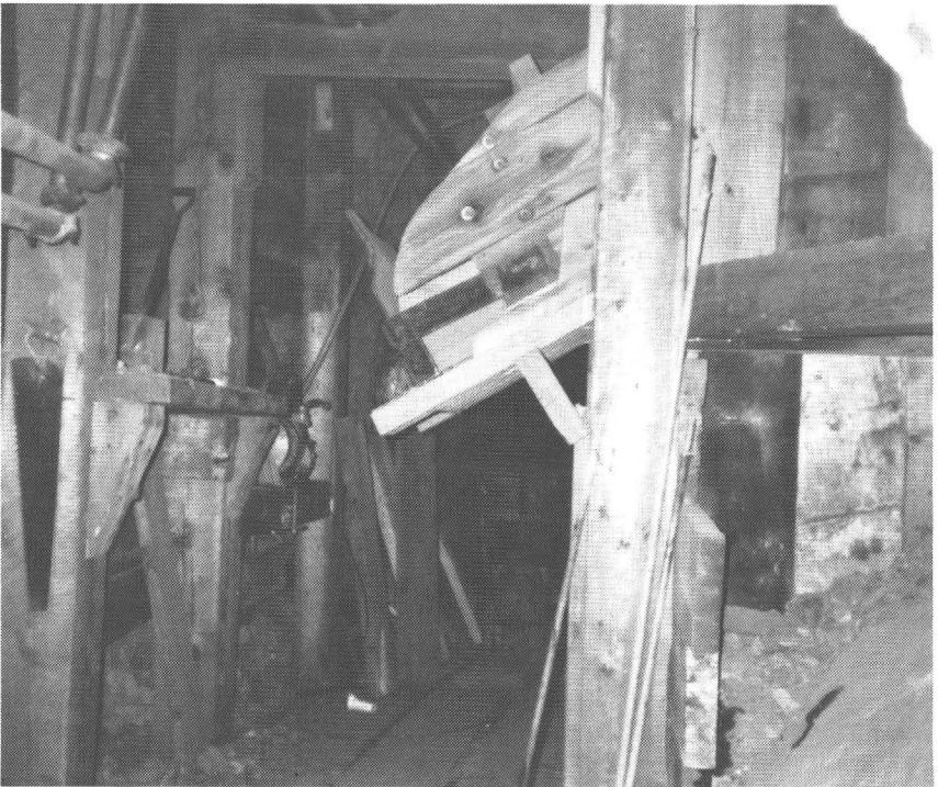
Haulage drift, Gold Prince Mine, Cochise County.

THE TANNER COMPANIES - 1685 Kiowa Bl., Kingman, AZ 855-7210.