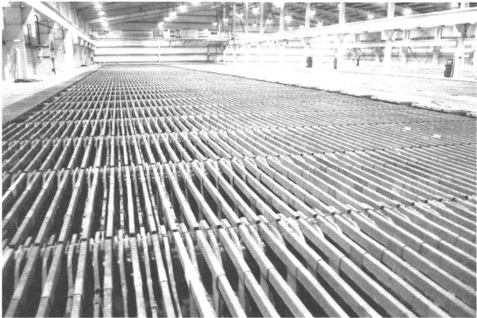
Morenci's electrowinning tankhouse.