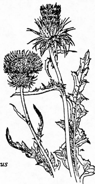
Thistles Carduus Californicus