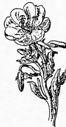
Evening Primrose Angorgra albicaulis