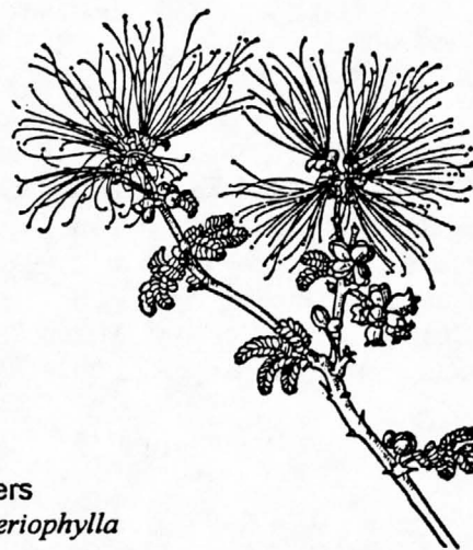
Fairy Dusters Calliandra eriophylla