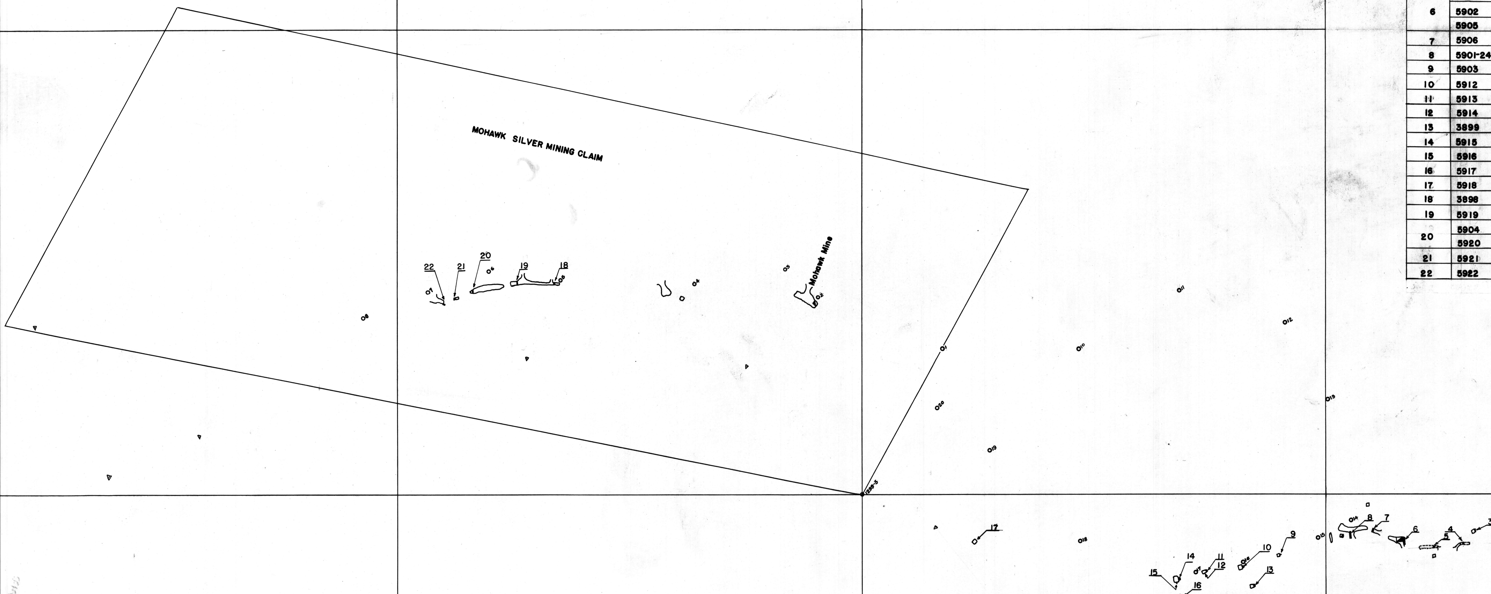
SAMPLE MAP OF MOHAWK-SILVER ZINC DEPOSIT, PIMA COUNTY SCALE 1"=100'