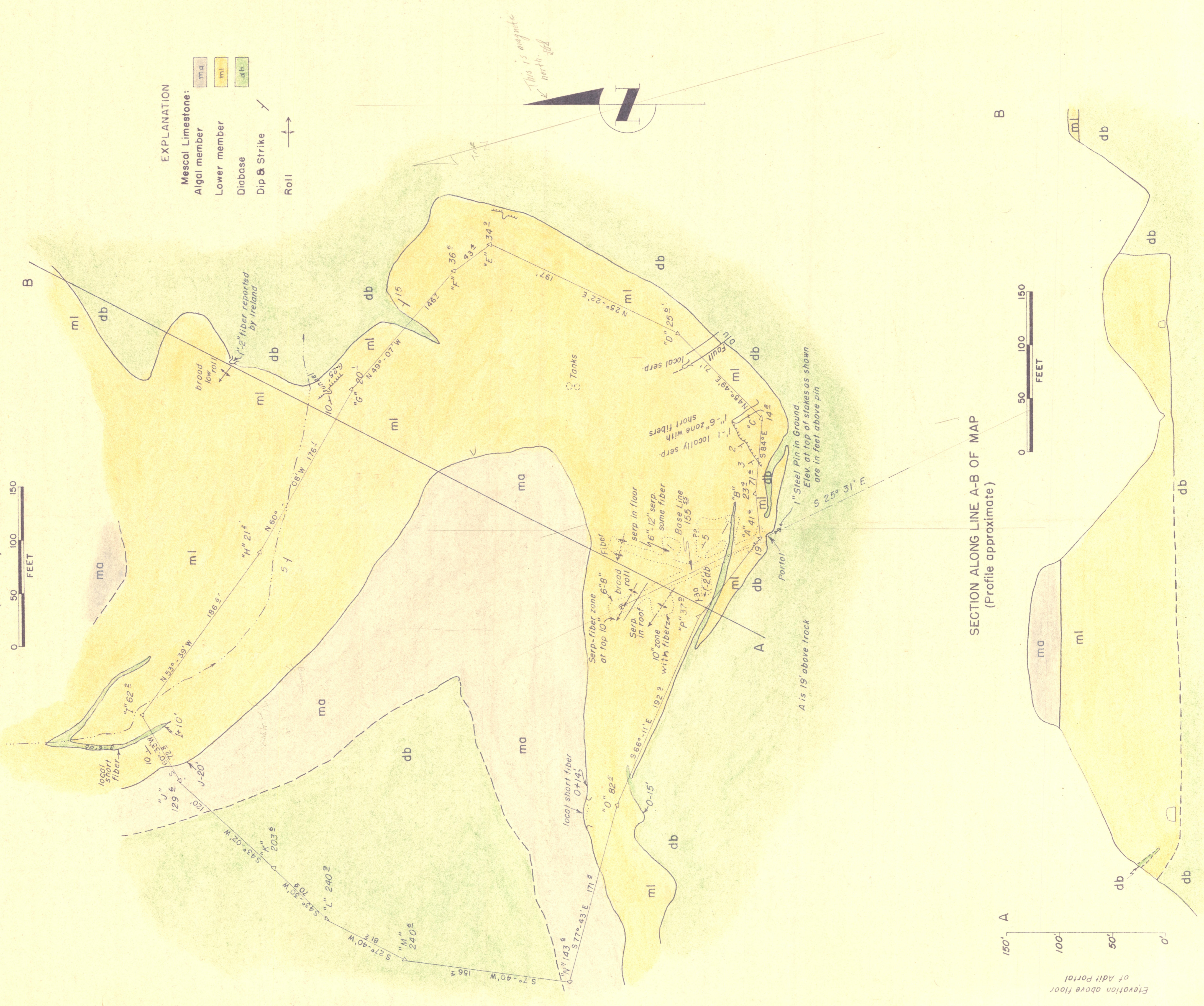
SECTION ALONG LINE A-B OF MAP (Profile approximate)