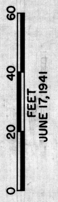
FIG. 4-ASSAY MAP OF MAGGIE ADIT, ARTILLERY PEAK MANGANESE, PROJECT 303, MOHAVE CO., ARIZONA