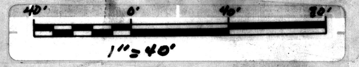
Plate XXIII - A

Tombstone Extension Plan of 200, 350, 485 & 500 levels 40 ft/inch 1936