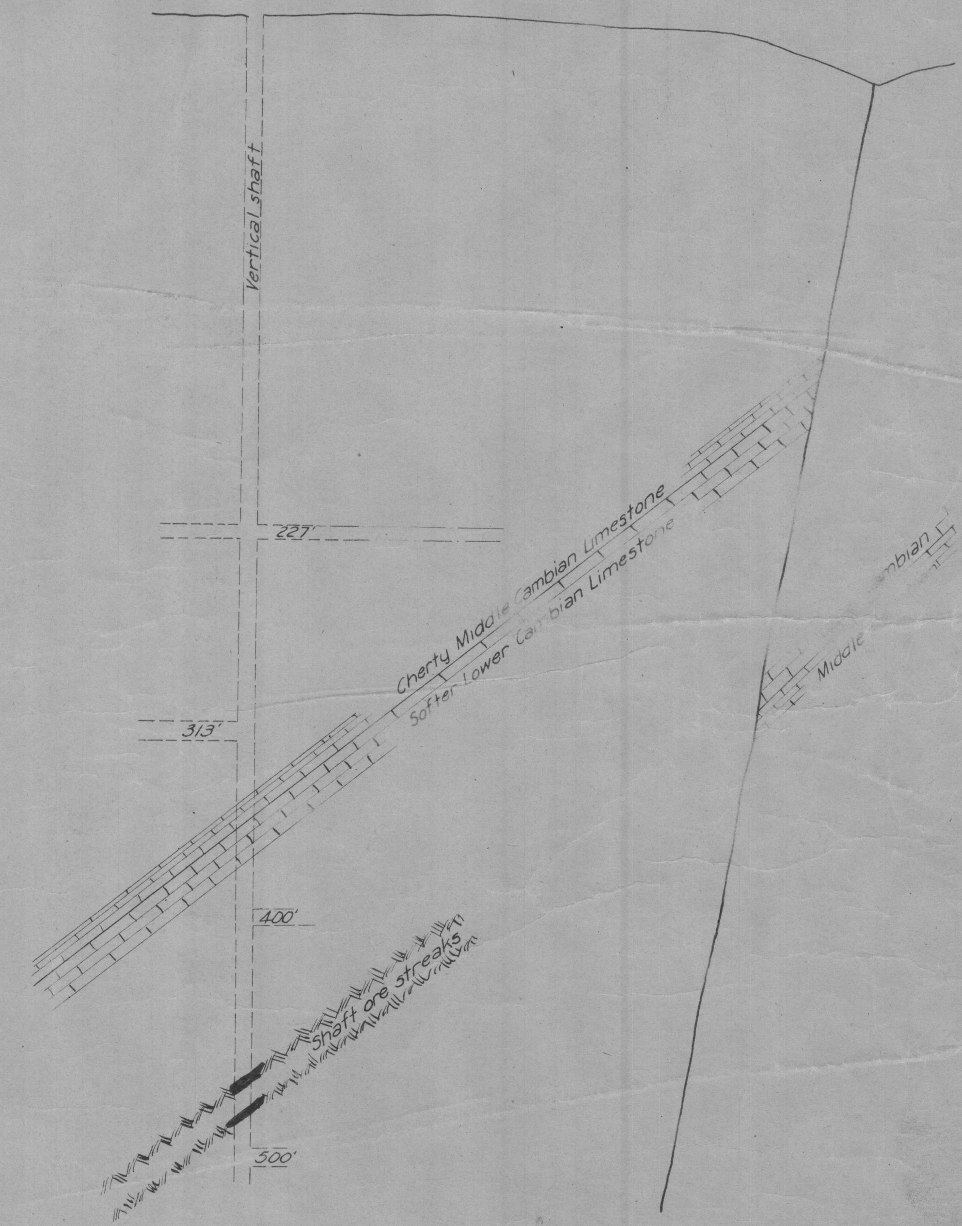
SECTION ON E-E'