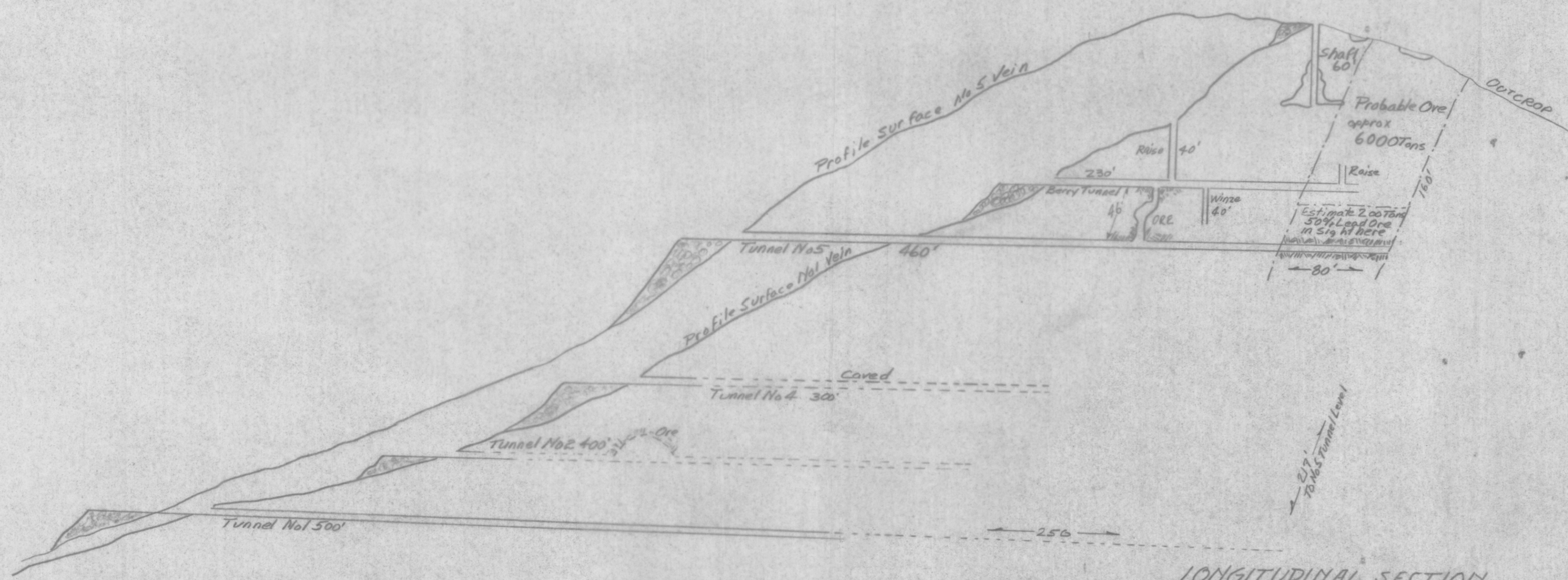
LONGITUDINAL SECTION THROUGH ST. LOUIS CLAIM SHOWING WORKS ON FIVE VEINS SCALE 1"=60' Report of R.E. Jacobson January 1922.