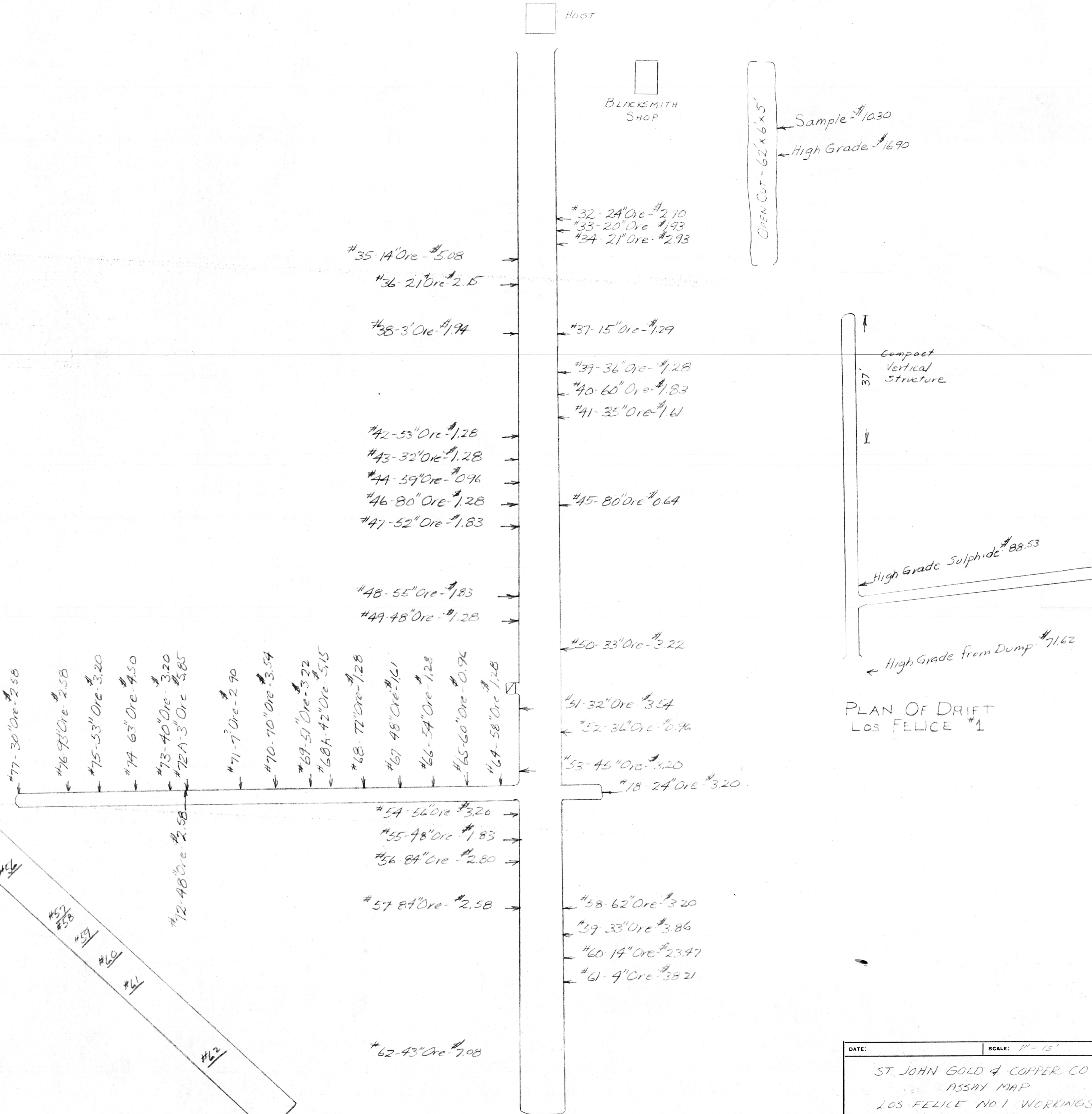
PLAN OF DRIFT LOS FELICE #1