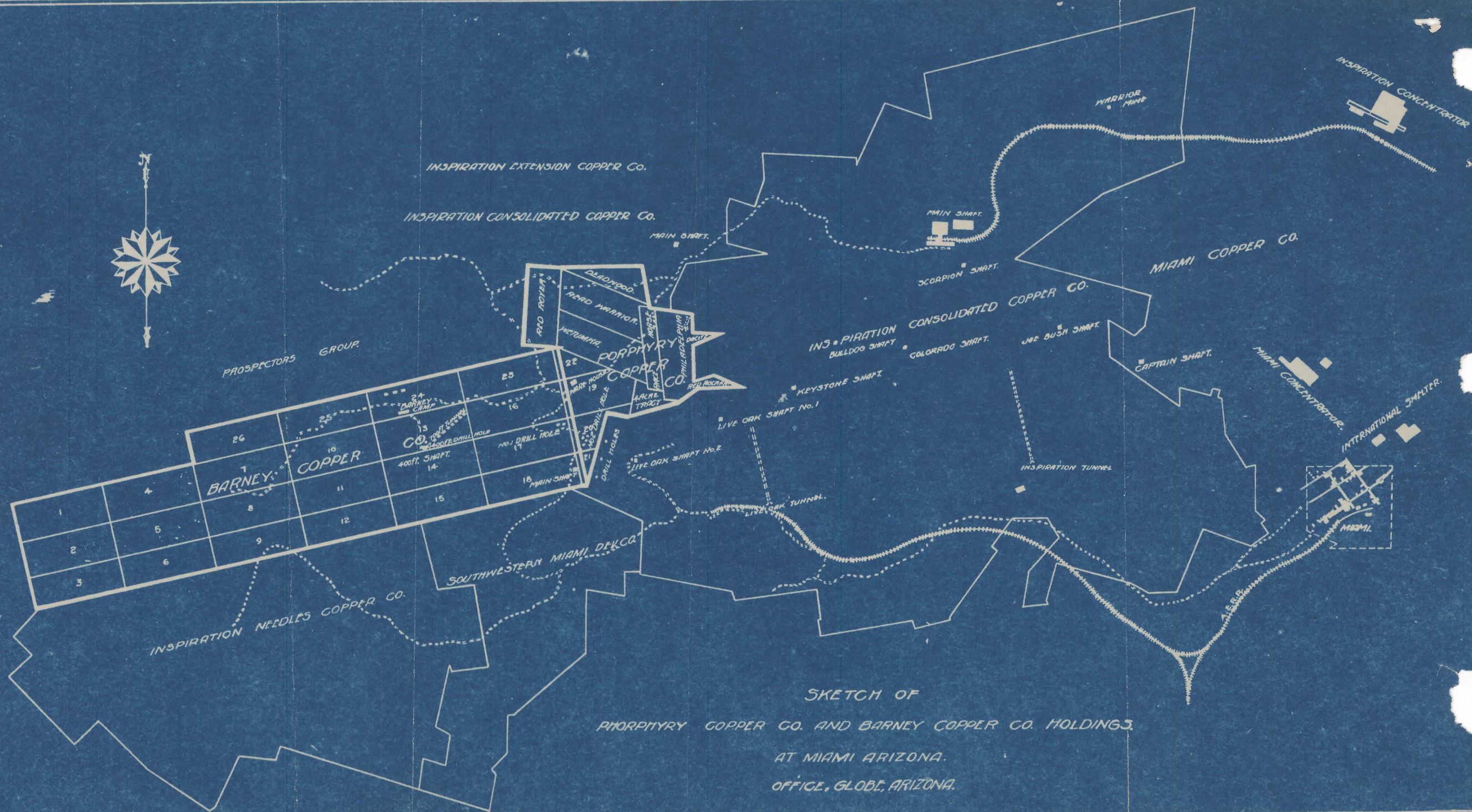
SKETCH OF PROPHYRY COPPER CO. AND BARNEY COPPER CO. HOLDINGS, AT MIAMI ARIZONA. OFFICE, GLOBE, ARIZONA.