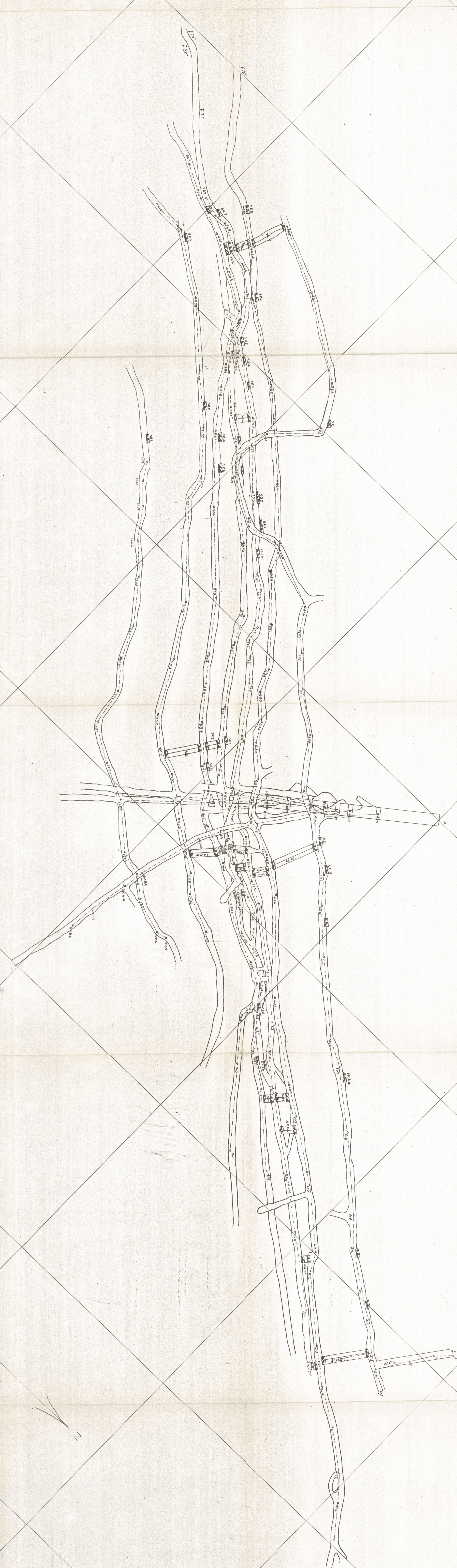
Plan of Shetland Wharves 1931