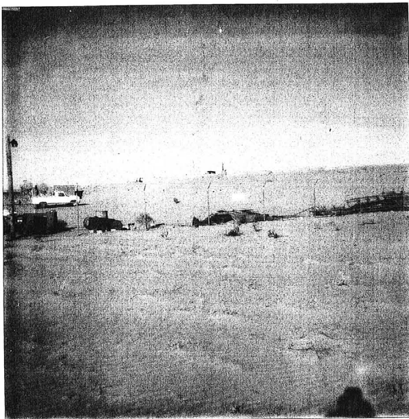
Alamo from SW Corn 1/4/85