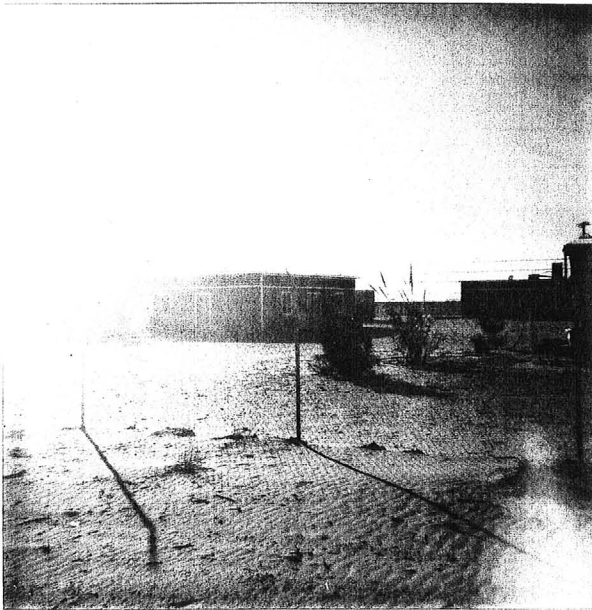
Alamo from E 1/4/85