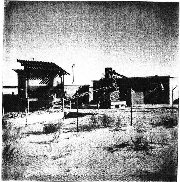
Alamo from West Side 1/4/85